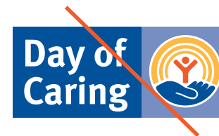
Never put other words or phrases inside the brandmark