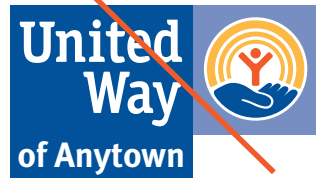
Never add a local name inside the brandmark