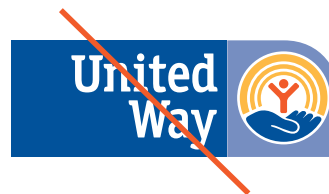
Never alter the shape of the brandmark in any way