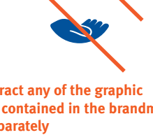
Never extract any of the graphic elements contained in the brandmark to use separately